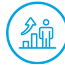
Projected 5-Year Population Growth