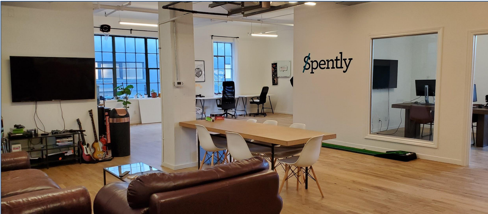
INTERIOR PHOTOS 1485 DUPONT STREET UNIT 210