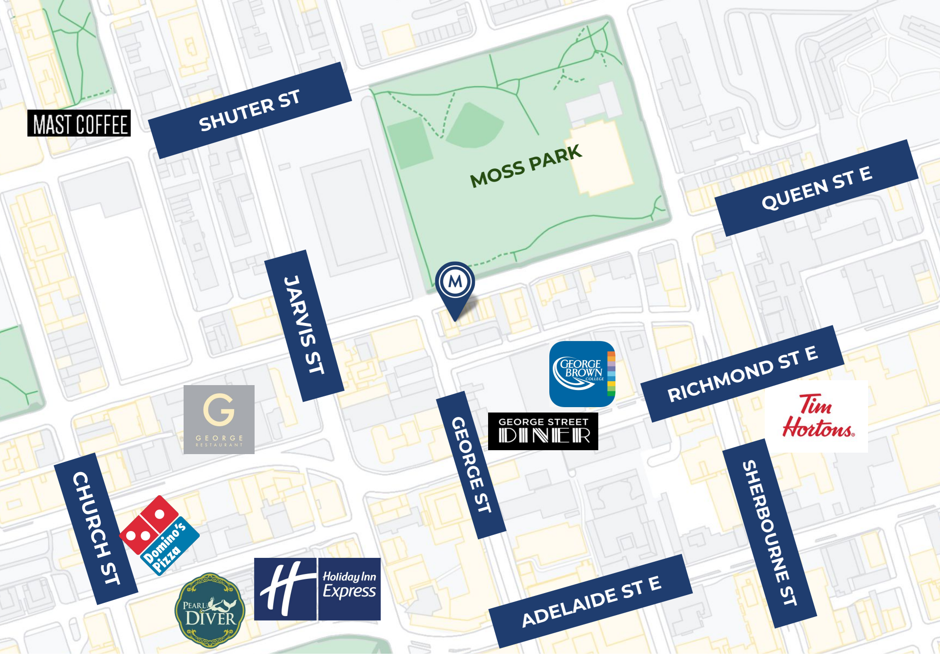
METROPOLITAN COMMERCIAL REALTY | 167-169 QUEEN STREET EAST