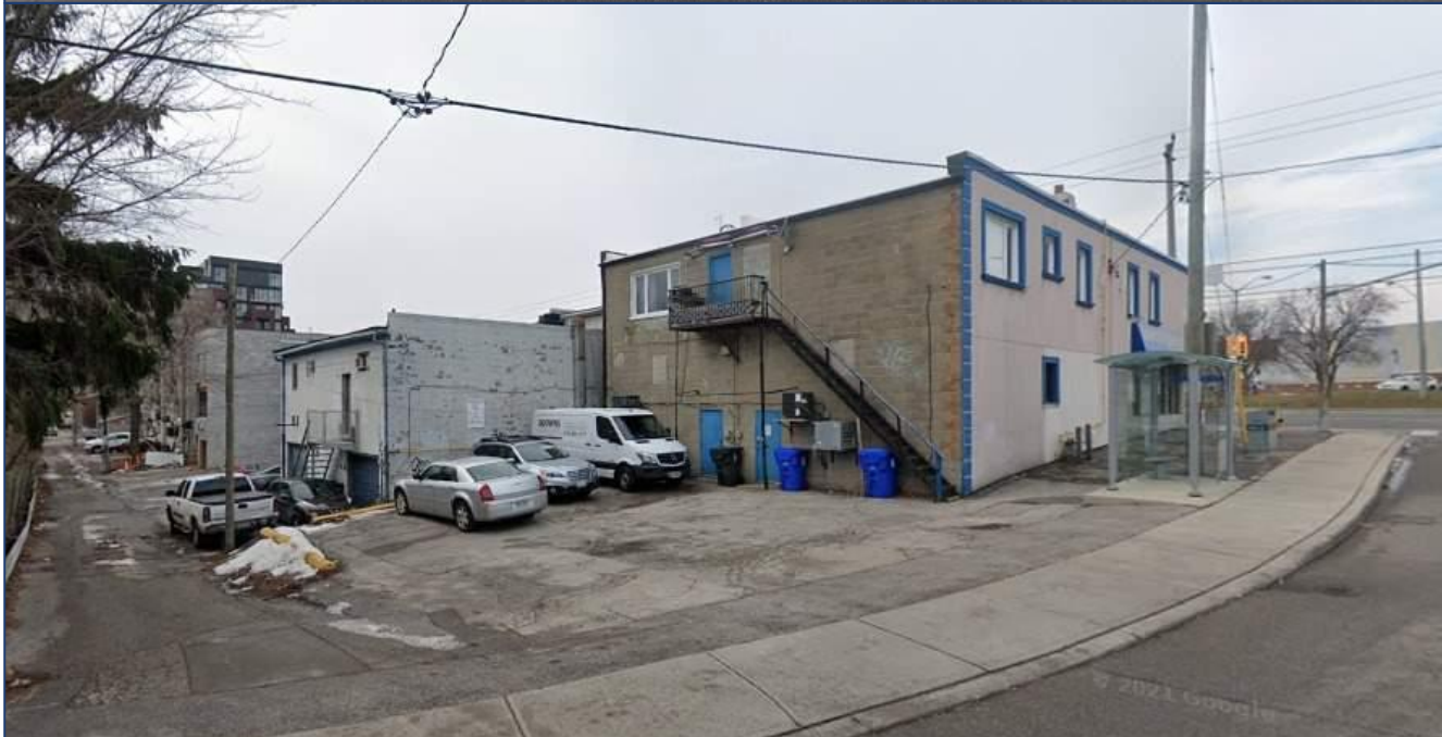
METROPOLITAN COMMERCIAL REALTY | 2581 KINGSTON ROAD